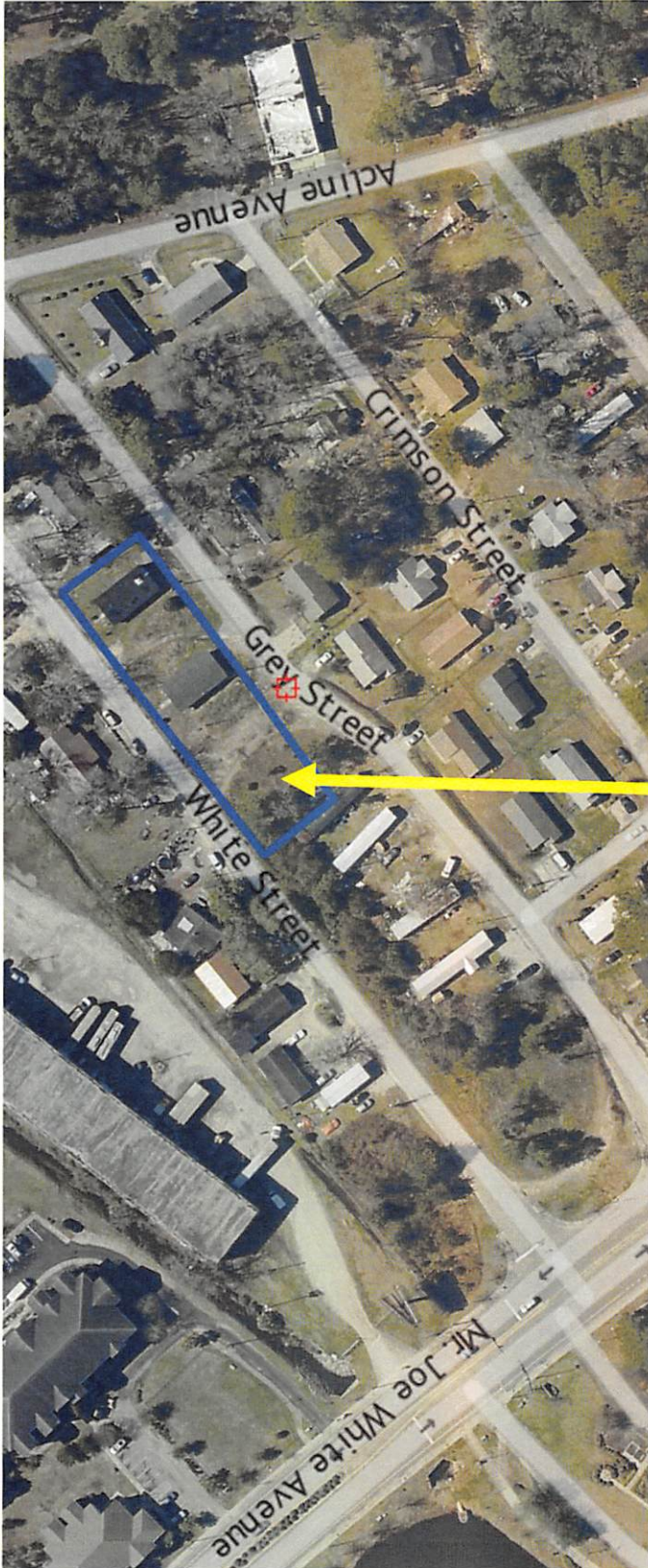
EXHIBIT A ORDINANCE 2022-XX

REZONE ~0.54 ACRES ON GREY STREET (PIN 42513030034) FROM R5 (SINGLE FAMILY) TO RMM (MULTIFAMILY MEDIUM DENSITY).